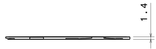
Front view Scale: 1:1