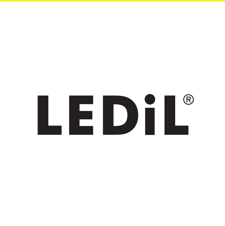
Black logo on white background