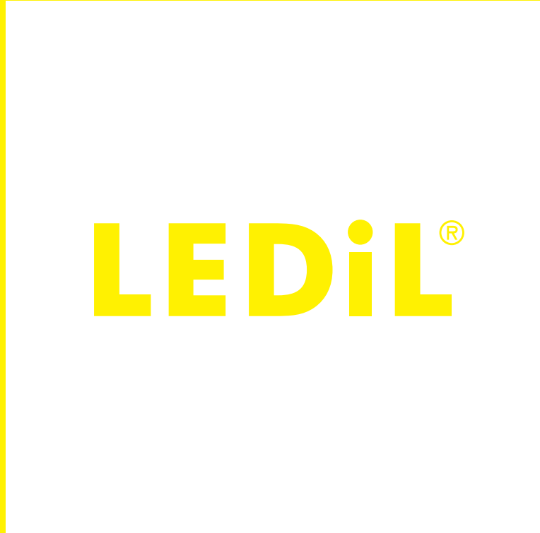
Yellow logo on white background