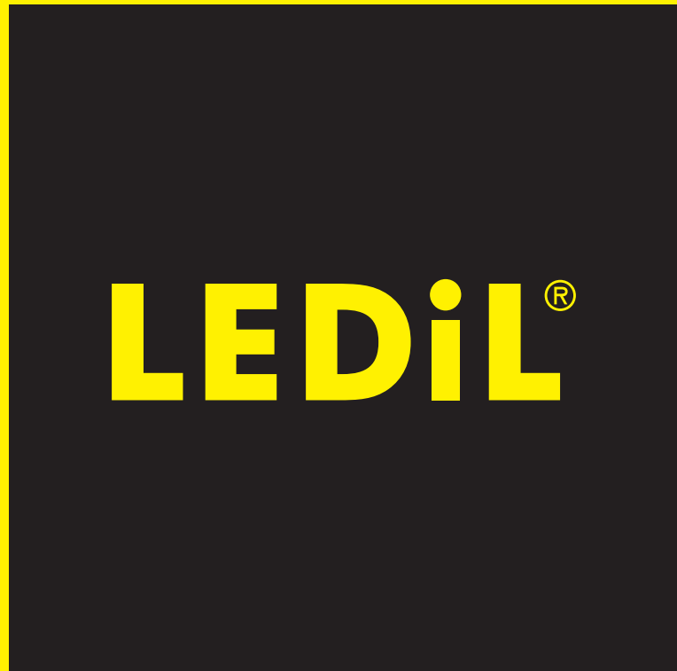
Yellow logo on black background