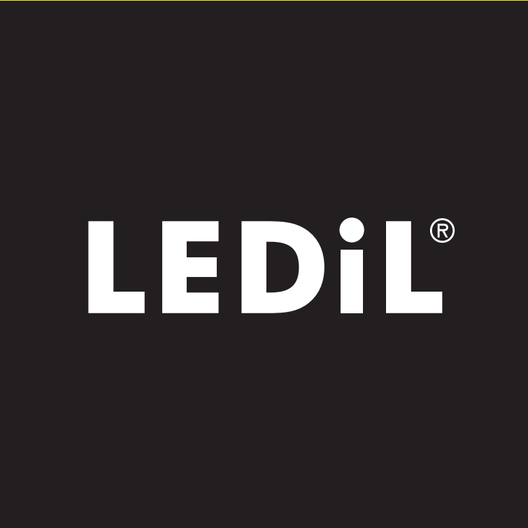
White logo on black background